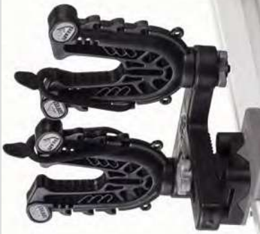
ATV/TEK FlexGrip™ PRO

NOTE: Requires a UMAX FusionFit™ Bed Attachment Kit.