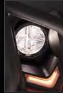
LED TURN SIGNALS