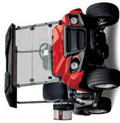
CORAL RED Metallic