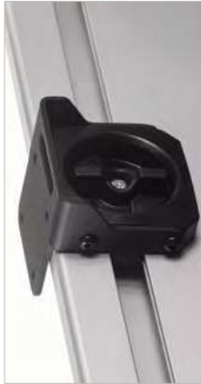
UMAX FusionFit™ Bed Attachment Kit

Using CAD modeling, FusionFit features meticulous mounting points per unit per accessory that ensures the most accurate installation system possible. FusionFit™ allows for the tightest tolerances that are unmatched and impossible to replicate with aftermarket products.