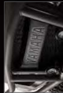
LED FRONT LOGO